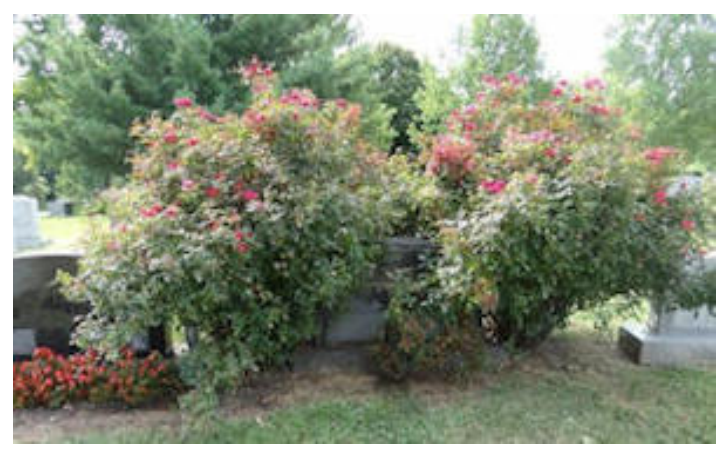
PLEASE DON'T: Plantings should not infringe on adjoining lots.

Flower beds may be established when the lot or grave has a permanent grave marker or headstone. Only one flowerbed is allowed on each lot. Generally, if the lot has a headstone and one or more foot markers, the flowerbed will be established at the headstone.