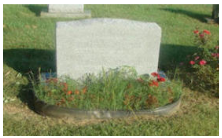
PLEASE DON'T: Neglected borders and flowerbeds detract from the beauty of Grove Hill.

If a flowerbed is abandoned, the person responsible shall contract with the cemetery to remove same and reseed the bed.